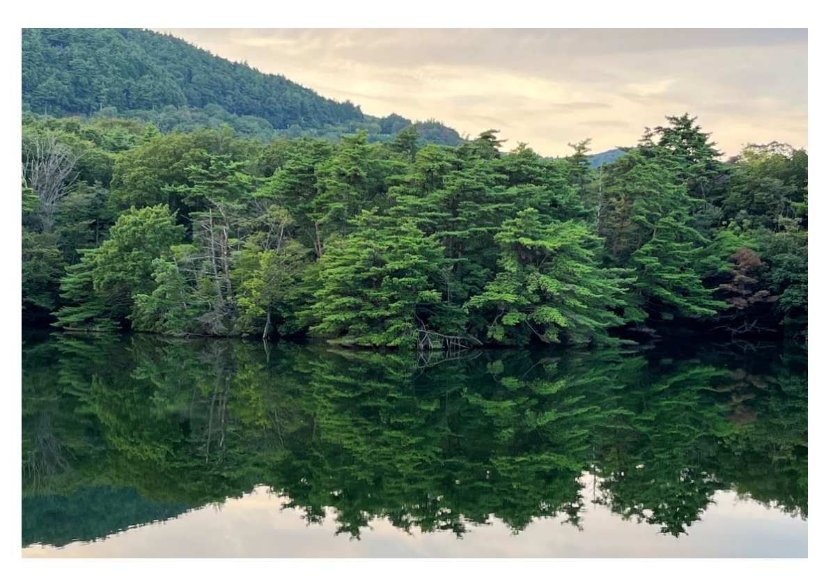
Okuike Pond in the Summer Dusk