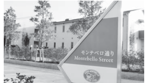
▲ A memorial (up photo) was erected at the entrance of the Shio-Ashiya Exchange Center in celebration of the 50th anniversary of the sister city agreement, and the street in front of the Center fondly named Montebello Street (down photo).

We wanted to thank all for the wonderful reception and program of events in Ashiya. The ceremonies, the excursions, and the meals were all wonderful. However, we especially enjoyed the time that we spent meeting and conversing with local people in Ashiya. Although I do not understand Japanese, there were many times when no language was needed to be spoken. Our wish is to have many more years of friendship and cooperation between the sister cities and the people of Ashiya and Montebello.