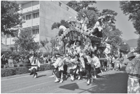
A scene of danjiri floats being pulled around in Yamanochi mountain district in 2011.

For information call: Ashiya Autumn Festival Committee Office Tel: 38-2033 (within City Hall Economics Section)