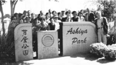
▲Recent picture of Ashiya Park in Montebello