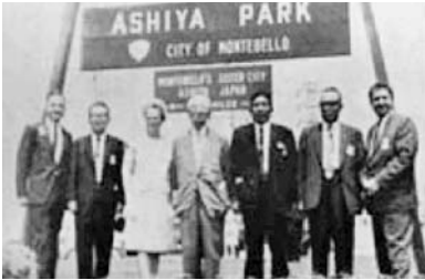
▲August 1972—completion of Ashiya Park in Montebello