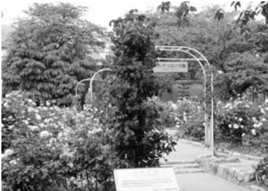
▲Montebello Rose Garden (within Iwagahira Park) – Opened in October 1973 to celebrate the Sister City Agreement. Location: 28 Iwazono-cho, ZIP 659-0013