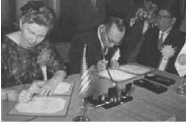
▲May 24, 1961—signing ceremony of the Sister City Agreement in the auditorium of Seido Elementary School