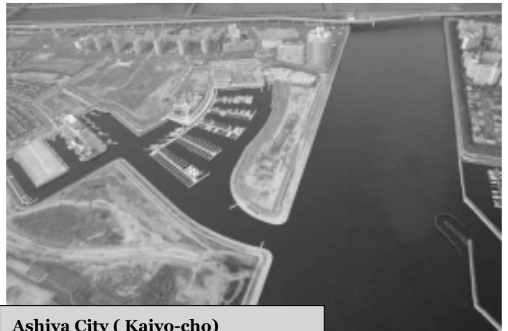
Ashiya City ( Kaiyo-cho)

Inquiries : Disaster Prevention and Safety Section Tel: 38-2093