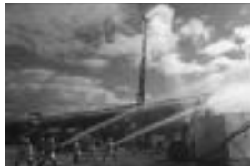
Winner of the 2004 Mayor's Award

Date and Time: January 9 (Sun.), 10:00 – 11:30 Place: Ashiya Seido Elementary School Grounds Program: Ceremony, rescue team performance, fire brigade performance *There is also a photo-taking corner with a rescue motorcycle. *A photo contest will be held simultaneously. Inquiries: General Affairs Section, Ashiya City Fire Department (Tel: 38-2095)