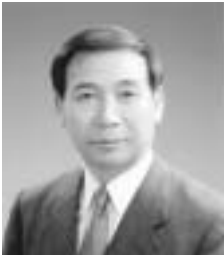
Ken Yamanaka Mayor of Ashiya

I am honored to have been elected to serve as the 18th mayor of Ashiya. For 24 years I had been involved in the city administration as a member of the City Council, but now I truly understand the full weight and responsibility of serving as mayor.