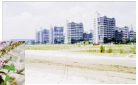
Landfill area of Minami-hama