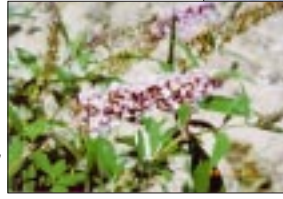
"Chichibu fujiutsugi" ( Buddleja davidii Franch.)