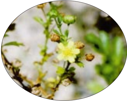
"Okijimushiro" ( Potentilla spina L.)

" Shirozakearitaso " ( Chenopodium ambrosoides L. var. pubescens Mak.) of the goosefoot family was found scattered about while the " houkigiku " ( Aster subulatus mickx.) was found in larger numbers.