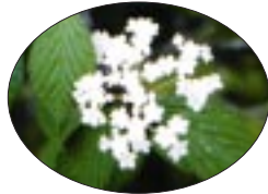
"Kobanogamazumi" (Vivurnum erosum)