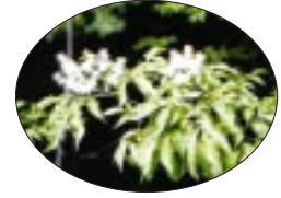
"Maruba-aodamo" (Fraxinus Sieboldiana Blune)

which are called "fusa akashia" (silver wattle) in Japanese. Acacia trees are planted along the bus route in front of Konan High School and they are covered with clusters of bright yellow flowers in March and April.