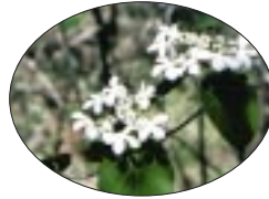
"Mushikari" (Viburnum frucatum)

acacia is a native of North America, and it is commonly planted along city streets and elsewhere to prevent the shifting and blowing of sand. False acacia were also planted to reforest the Rokko Mountains.