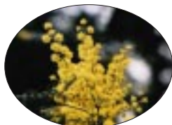
"Fusa akashia" (Silver wattle)

The several three to four-meter-tall "mushikari" (Viburnum frucatum) trees just behind the Royuhoden Gate also bloom every spring.