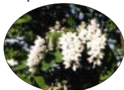
"Harienju" (False acacia)

In the Asahigaoka-cho area and at the foot of Mt. Egeyama the air is perfumed by the clumps of white flowers on the "harien-ju" (false acacia) trees. For some reason, this tree is known in Japan by the name acacia, even though it is not the true acacia tree found in other parts of the world. The false