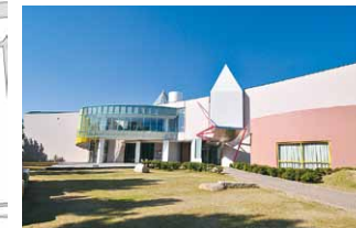
Ashiya City Museum of Art and History