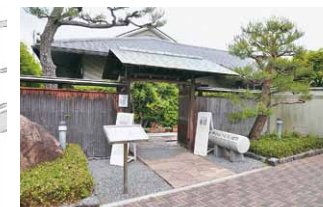
Tanizaki Junichiro Memorial Museum