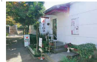
Cafe in Ashiya cultural zone